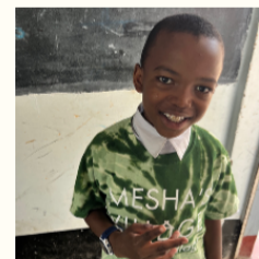
Junior Turns 11 on 11/02