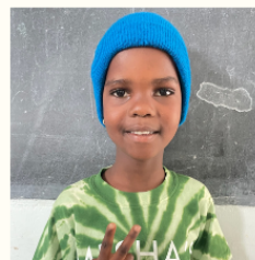
Gracious Turns 8 on 11/15